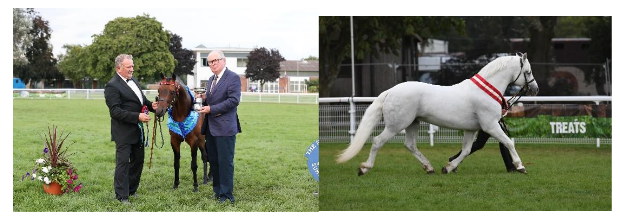
Not before 2pm

A showcase of British Riding Pony and Mountain & Moorland stallions that will be standing at stud in 2024. Please contact studbook@nationalponysociety.com if you would like to book your place in the parade.